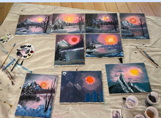
Bob Ross Paint Along