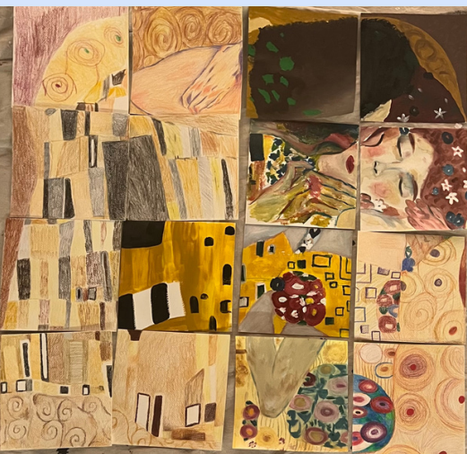
Group Mural of The Kiss by Gustav Klimt