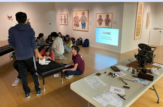
Spooky Print Making