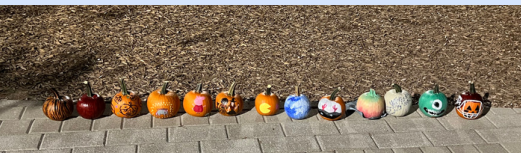
Halloween Pumpkin Painting