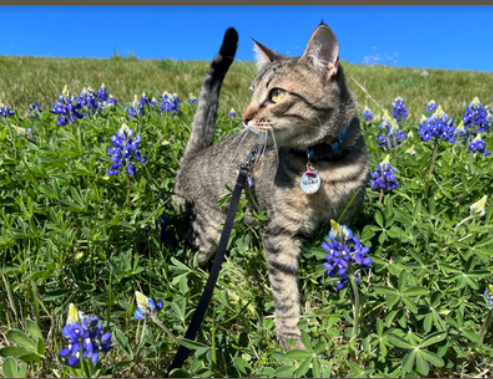
From Wildflower Exhibit