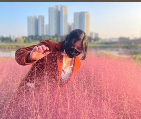
From Study Abroad Exhibit

Aggie Frame of Mind is an exhibit of 12 photographs on the second floor of the Memorial Student Center, adjacent to the main entrance of the Bethancourt Ballroom. The selection of images changes every 3-4 months and features an aspect of the Aggie experience. Connected by time, location, community, and creativity, the Aggie Frame of Mind photos allow students of Texas A&M to showcase their talent and tell their stories like no other exhibit can.