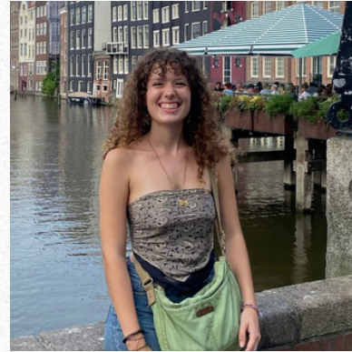
Reynolds Gallery Director

Fun Fact? I can recite the alphabet backwards!