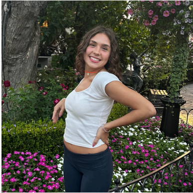
External Development Director